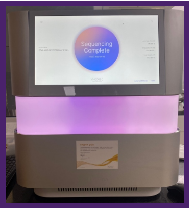
Illumina Nextseq 2000