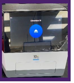
10x Genmoics Chromium iX