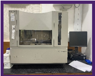
Thermofisher 3730xl Fragment Analyzer