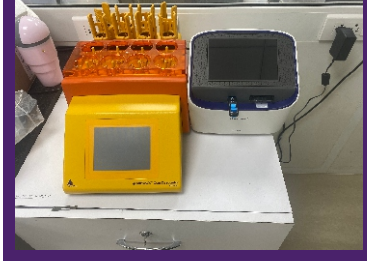
Miltenyi MACS octodissociator